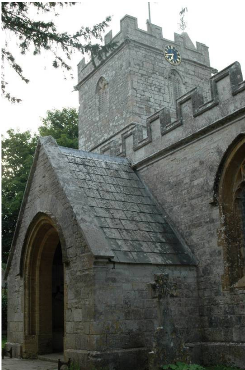
Osmington Parish Church, Dorset