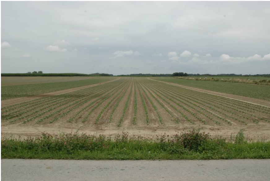
Looking North from the Aden House – Turenne Crossing road towards Houthulst wood which the 18 Bn Lancashire Fusiliers attacked on 22 nd October 1917 as part of the battle of Pascendale (3 rd Ypres).

The following is the account from the War diary: