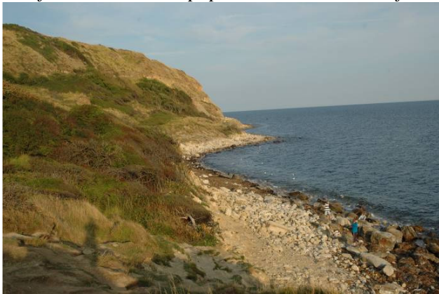
The coast from Osmington Mills