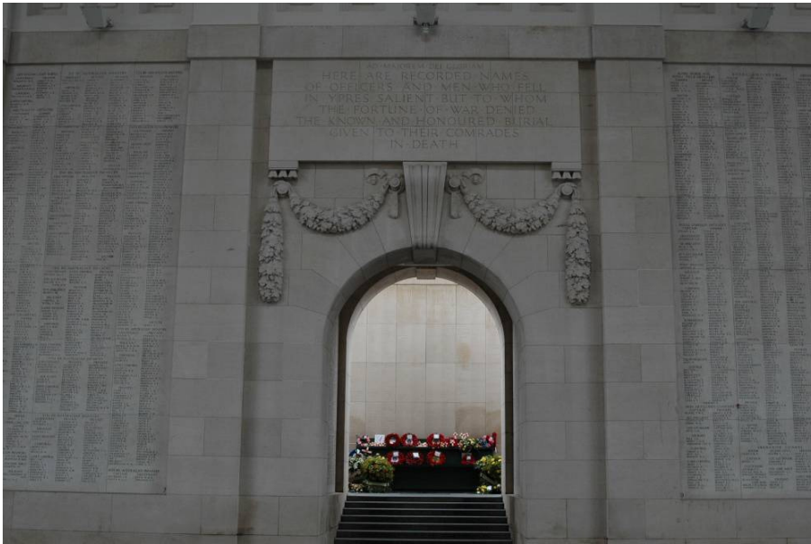
Inside the Menin Gate.