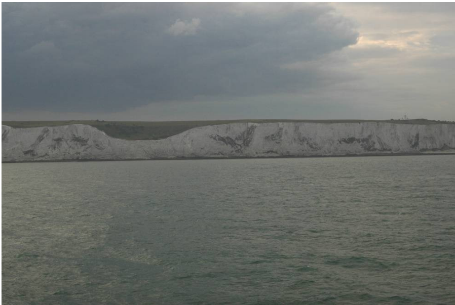
White cliffs of Dover.