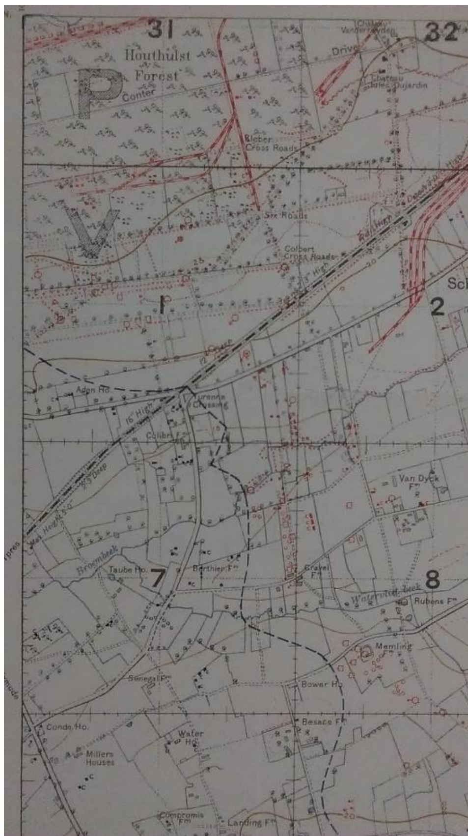
Trench Map showing Turenne Crossing. Ref National Archives WO 297/639