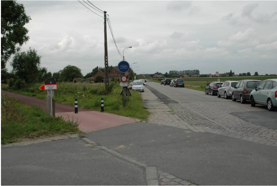
Looking from Turenne Crossing towards Aden House. The angle formed between the road and the old railway line is described as the location of the German machine gun pill box and the objective of the raid.