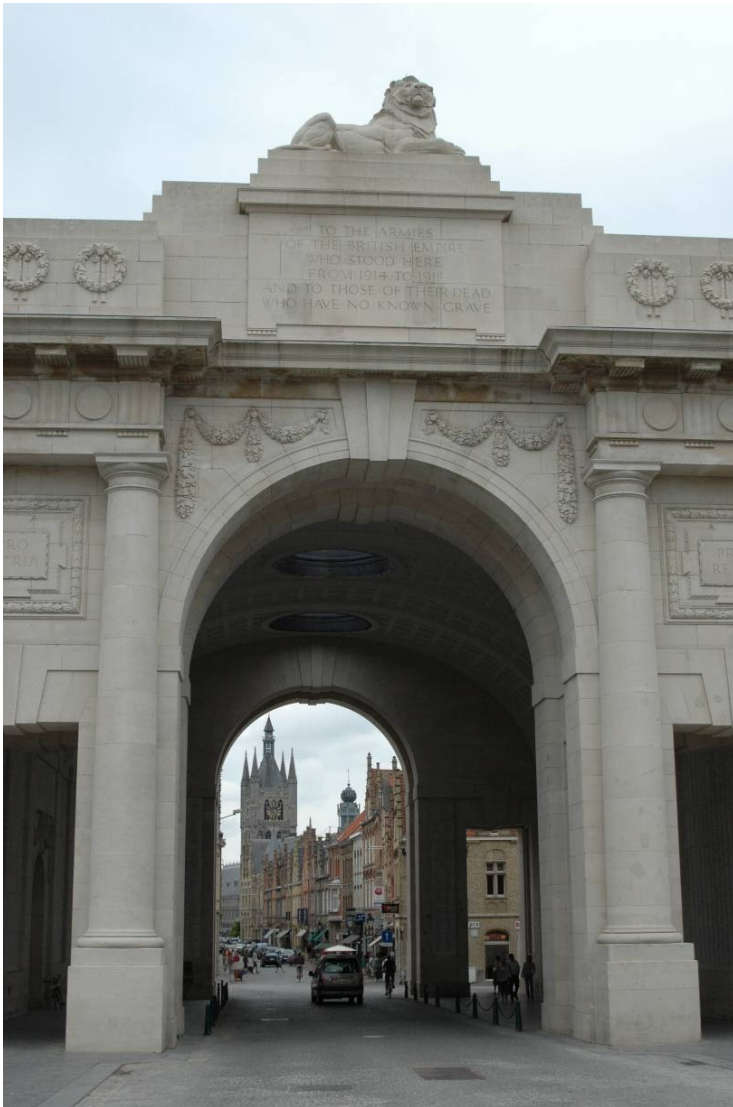
Menin Gate, Ypres