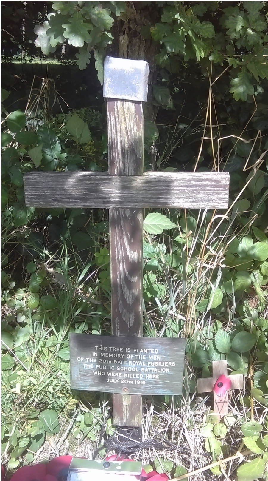
Memorial cross next to High Wood in memory of the men of the 20 th Batt Royal Fusiliers (The Public School Battalion) who were killed on July 20 th 1916. (Photographed in 2016)