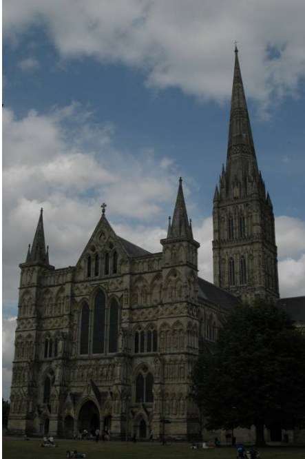
Lichfield cathedral, a popular Christmas card from Dorothy Franks